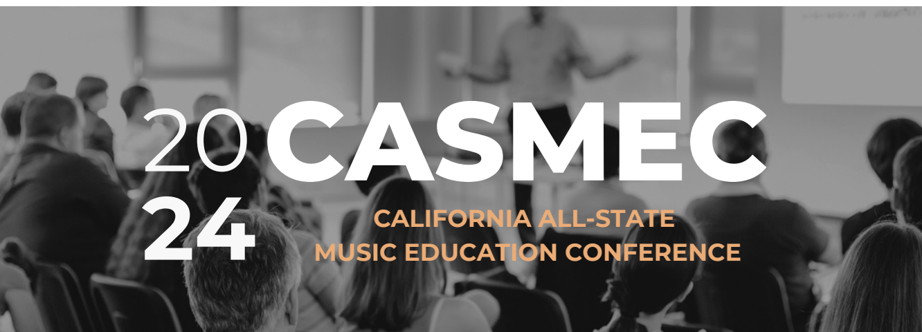
Location SAFE Credit Union Convention Center Sacramento, CA